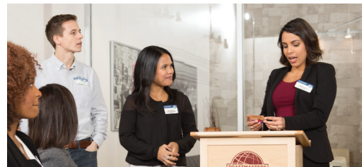
Table Topics. During Table Topics, all attendees have an opportunity to present one- to two-minute impromptu talks. This is often the most challenging and fun part of your meeting.

The order and length of these segments may differ from club to club. The length of a club meeting often determines the amount of time for each segment.